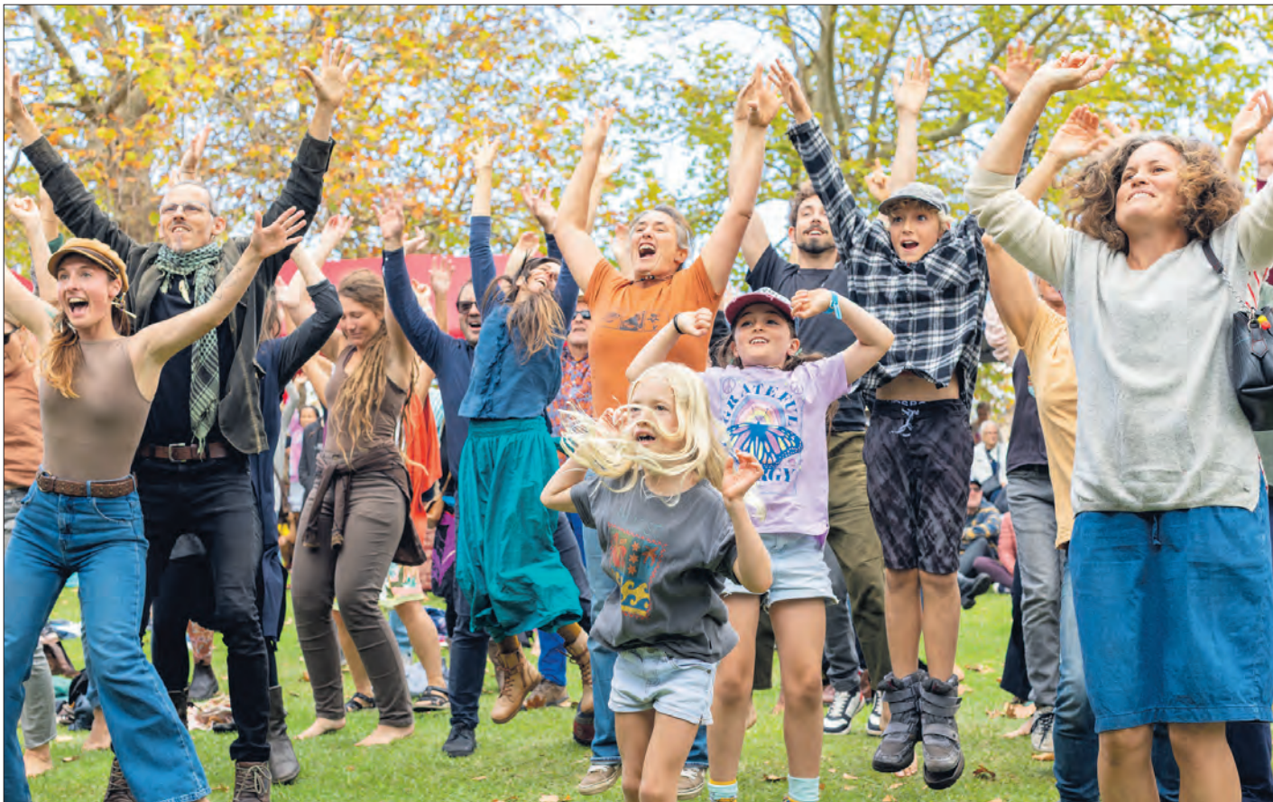
Market-goers enjoy fun with friends.