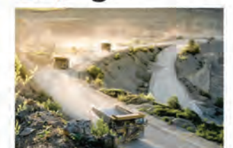
Innovating extraction and process methods