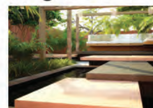
Concrete designed with aesthetics in mind