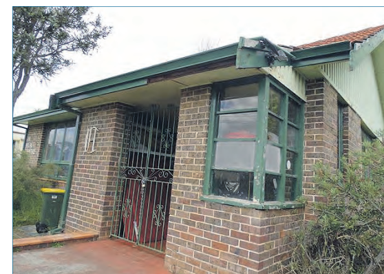
Infant health centre – gone but not forgotten.