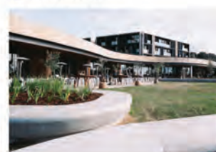
Low carbon concrete >30% carbon reduction