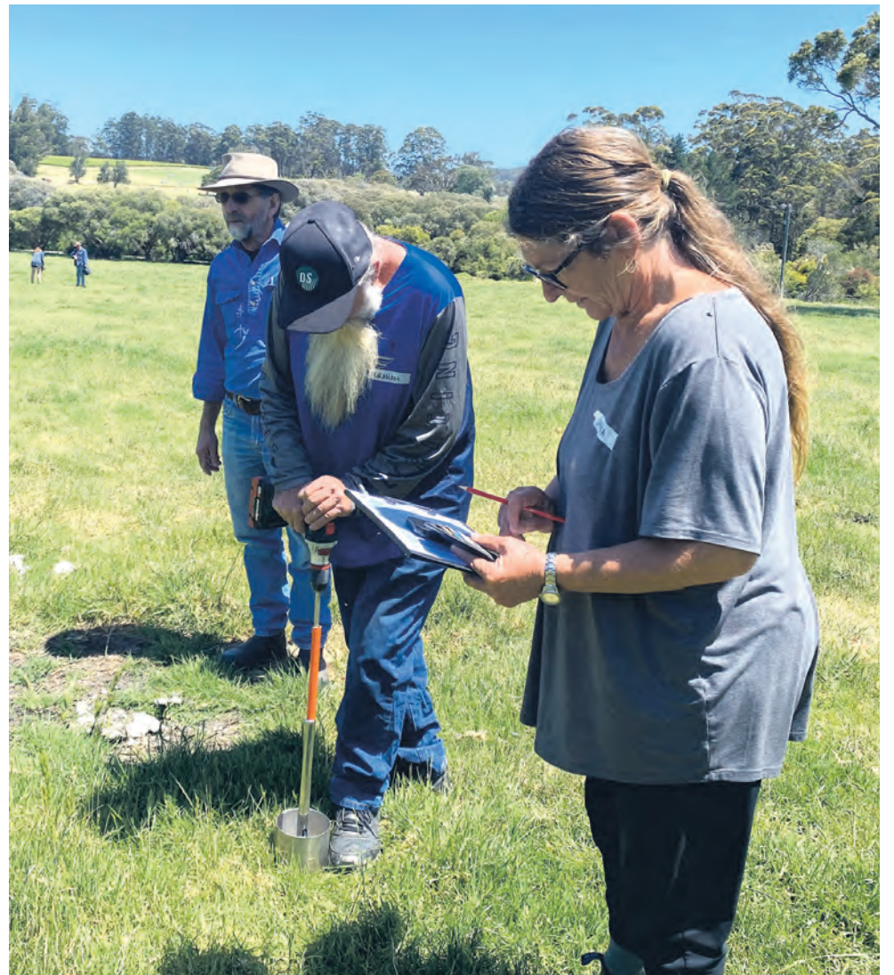
Farmers take part in a soil testing demonstration.

The program is delivered via Healthy Estuaries WA and Soils – New Horizons in partnership with the Wilson Inlet Catchment Committee, the Department of Primary Industries and Regional Development and DWER.