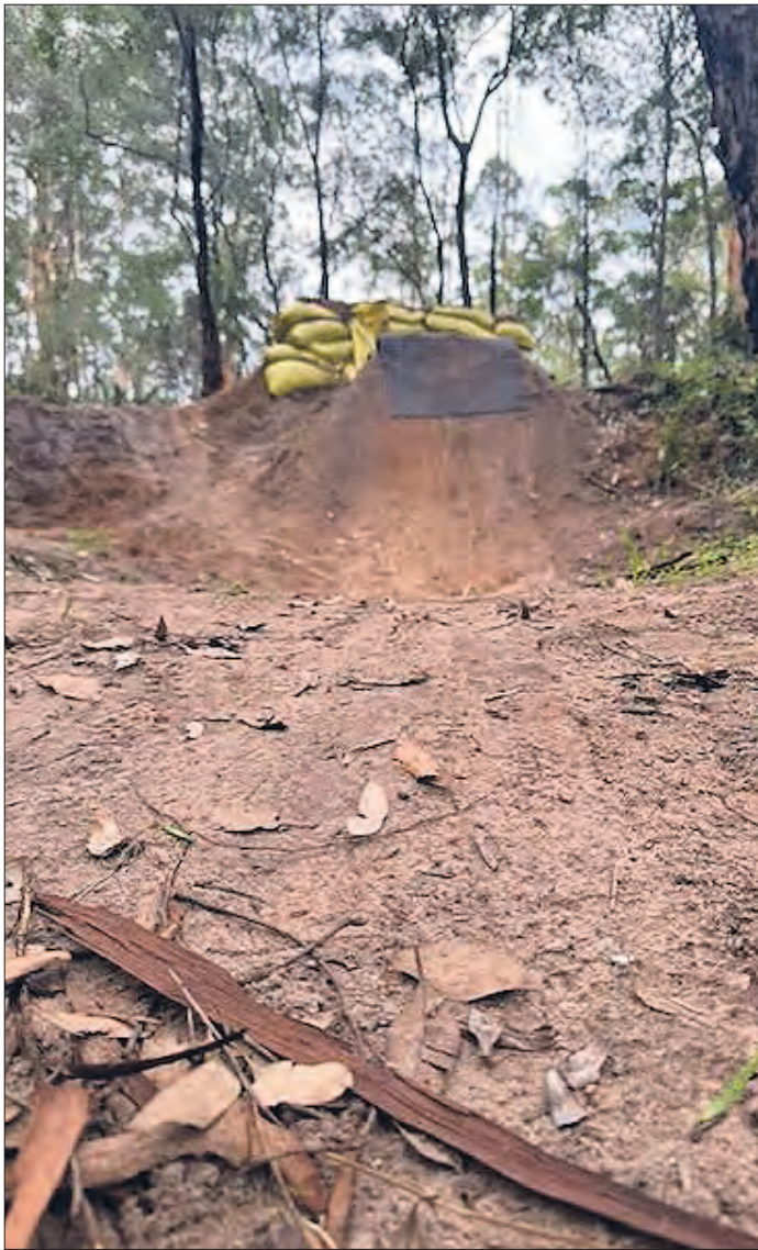
Sand bags have been placed to build a jump off.

"One of the most iconic stretches of WA's South Coast and well-loved sections of the Bibbulmun Track has been turned into a scorched mess for no demonstrable benefit," he said.